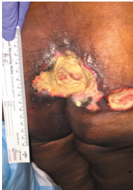
Initial wound, traditional wound care started 03/08/17