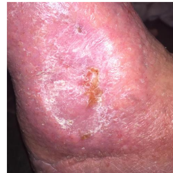
Chronic wound healed using Pure&Clean 03/05/18