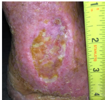
Less than 4 months after starting P&C 01/18/18